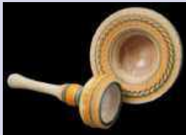
Jerry Laffer Top Box Maple w/Markers