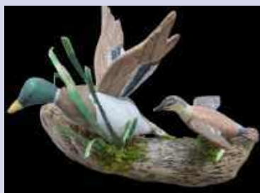
3 rd – Arlene Schlueter Ducks in the Weeds Basswood, Moss, & Driftwood Acrylics