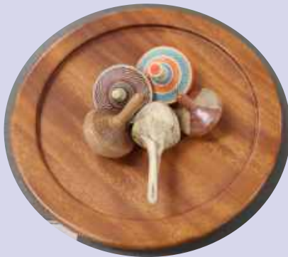
Robert Love Tops on Spin Plate Various Woods w/Mahogany Plate Beall Buffed & Carnauba Wax