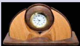
Jim Ruddock Holding Time Oak & Walnut Mineral Oil & Beeswax