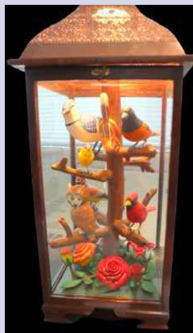
2 nd – Gary Morison Carvings in a Cage Basswood Acrylics Cage Repurposed After Found on Road