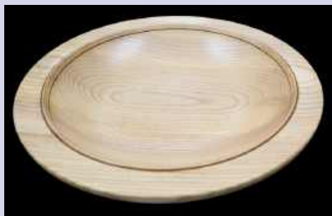
3 rd – Charlie LaPrease Large Ash Platter Osmo