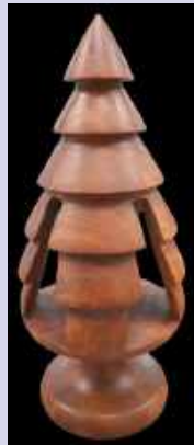
Tie 2 nd – Mark Lockwood Inside-Out Tree Cherry & Maple Friction Polish