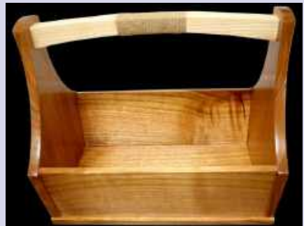
Tied 3 rd – Bruce Meissner Tool Tote Butternut with Shellac