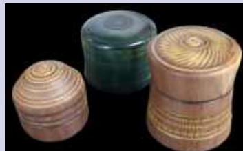
Tied 3 rd – Robert Love Ring Boxes Walnut w/Gold Enhanced Texturing (2) Curly Maple Dyed Black & Green Osmo Buffed