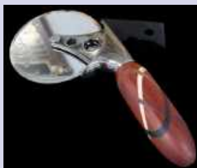
Bob Hugget Pizza Cutter with Celtic Circles Padauk w/Walnut, Purpleheart, Wenge, & Maple Watco & Butcher Block Oil