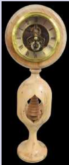
2 nd – Mark Lockwood Inside Out Clock Ambrosia Maple & Maple Friction Polish