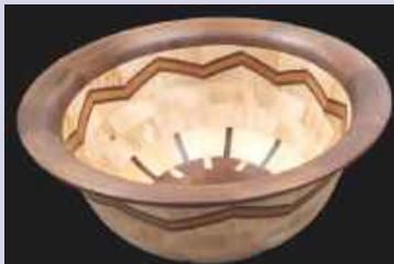
2 nd – Jim Farrell Reunion Bowl—Segmented Chevron Walnut, Curly Maple, & Cherry Walnut Oil & Beeswax