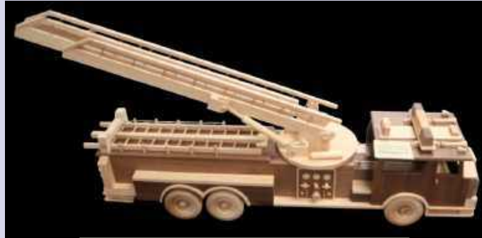
1 st – Mike Shuron Ladder Fire Truck Maple & Walnut w/Satin Lacquer