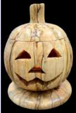
1 st – Dave Grant Pumkin Box Spalted Maple w/Osmo Burr cutter made ridges; air reciprocating saw made face