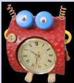
Dave Grant Funky Clock Sumac w/Spray Paint & Acrylics Textured with Burr Cutter / Scrolled & Carved Feet / Various Hardware Accessories