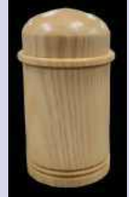
Charlie LaPrease Ash Box Osmo