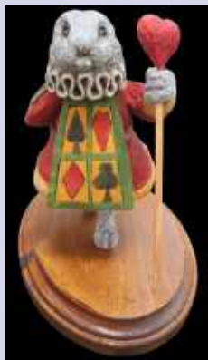
1 st – Deb Barbour Alice In Wonderland Rabbit Basswood Acrylics