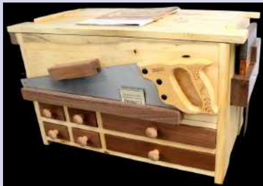
1 st – Gary Kieffer Portable Cool Tool Stool White Pine, Walnut, Maple, & Hardboard Minwax Water-Based Gloss Poly Woodsmith, No. 279, June 2025