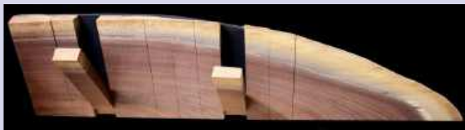
Mark Anastas Coat/Hat Rack Live Edge Walnut with Osmo