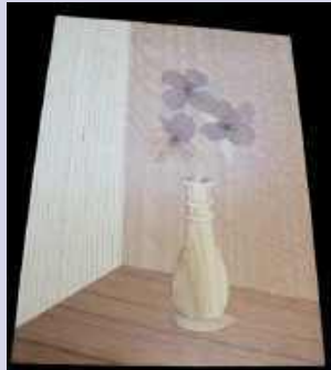
1 st – Terry Dote Double Bevel Marquetry Picture Various Veneers Shellac Demo—Feb 2026