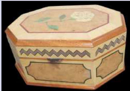
1 st – Terry Dote Octagon Jewelry Box Olive Ash Burl, Oak Burl, Colored Veneers w/Shellac Finish Assembled w/Hide Glue