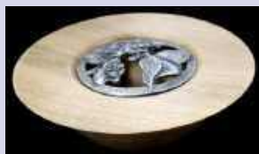
Dave Grant Potpourri Bowl Maple w/Oil Decorative Insert Purchased