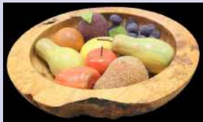
1 st – Larry Prunotto Burl Bowl w/Some Turned Fruit Friction Polish