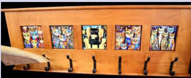
3 rd – Tom Cooney Tiled Coat Hanger Cherry with Osmo