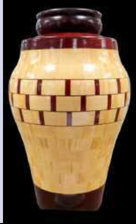
2 nd – Larry Prunotto “Our Final Resting Place” Maple & Purpleheart Segmented Urn Friction Polish