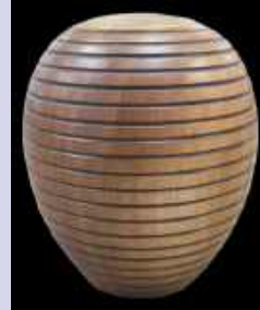
3 rd – Robert Love Beaded & Textured Walnut Box Gold Paint & Osmo