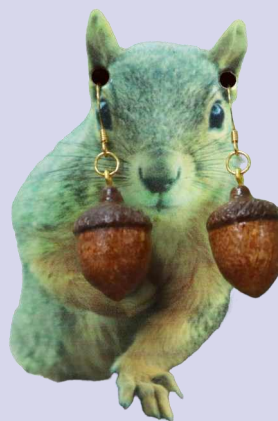
2 nd – Dave Grant Acorn Nut Turned Earrings Monkey Pod Cap Decorated w/Knurling Tool