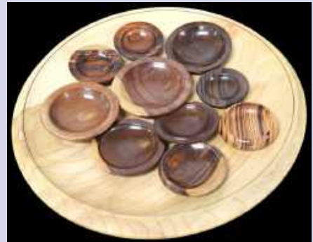
Tied 3 rd – Charlie LaPrease Small Plates for Small Meals Various Exotic Woods—No Finish