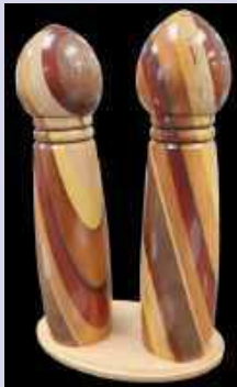
1 st – Rod Castle Salt & Pepper Grinder Set with Base Laminated Hardwoods Wipe-On Poly