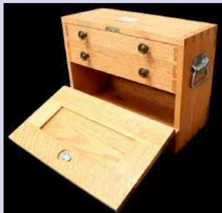
Jeff Handel Red Oak Toolbox Homemade Paste Wax (Linseed Oil & Beeswax) Toolbox with a lockable door and two internal shelves. All stock was prepared with hand tools only from rough-sawn or bandsawn lumber. All joinery was done by hand (dovetails, raised panel drawer bottoms in grooves, drawer runner grooves). 20" x 14" x 9"