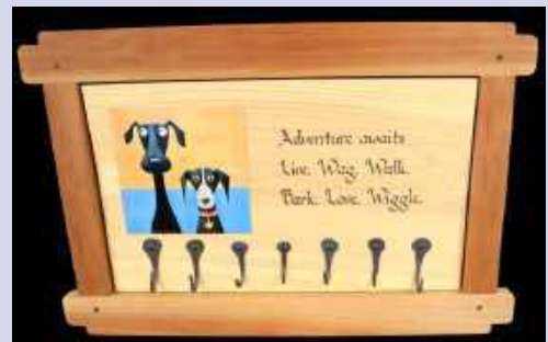
Tom Cooney Mixed Media Dog Leash Holder Cherry & Pine w/Osmo Combination of Woodworking, Blacksmithing (Hooks), & Calligraphy