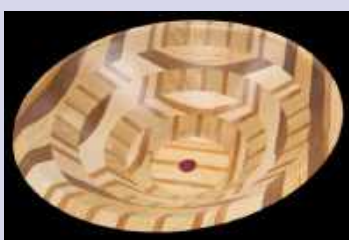
Tom Cooney Bowl from a Board Using Scrap Wood Red & White Oak, Maple, Walnut, & Cherry w/Oil