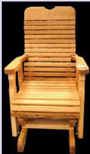
Gary Morison 'Beaver Lake' Glider Oak w/Bush Oil