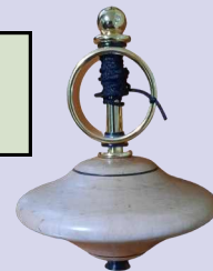
Mark Lockwood Hard Maple Top Friction Polish