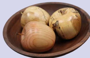
Tie 2 nd – Dave Grant Apples in Walnut Bowl Spalted Maple (2) Tamarack/Larch (1) Livos Hardwax Oil