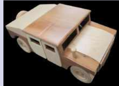
3 rd – Mike Shuron H1 Hummer Maple & Walnut Satin Lacquer