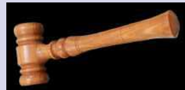
Charlie LaPrease Gavel Locust Buffed