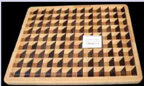
2 nd – Bruce Meissner Cutting Board Walnut, Maple, & Cherry Mineral Oil & Beeswax