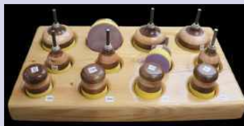
Gary Morison Power Sanding Attachments Black Walnut & Curly Maple w/Poly