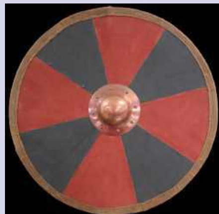
Tom Cooney Viking Shield Spruce Core w/Glue Soaked Painted Linen Covering, Leather Edge, & Copper