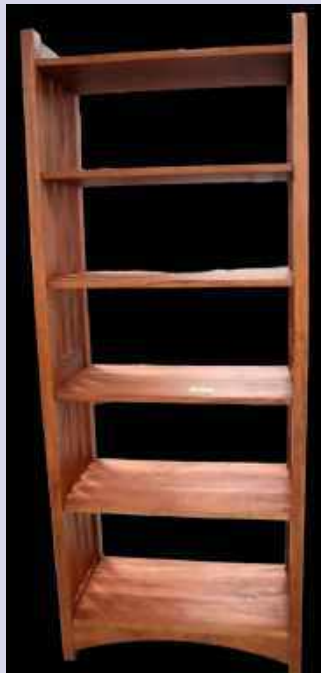
Kevin Rawlings Bookshelf Basswood w/Shellac