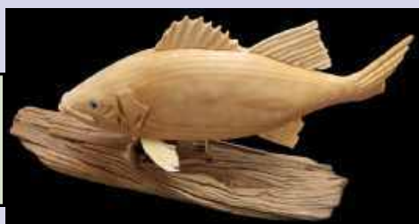
Patrick Grobauer Fish Basswood & Driftwood Natural