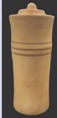
Jerry Laffer Lidded Box Maple