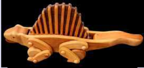
1 st – Jim Ruddock Dimetrodon (Sail Dinosaur) Walnut & Maple w/Mineral Oil